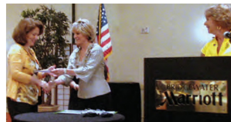
Bernardsville GC gets award.